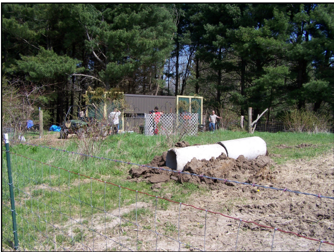
Work progresses during Orange and Black Give Back Day